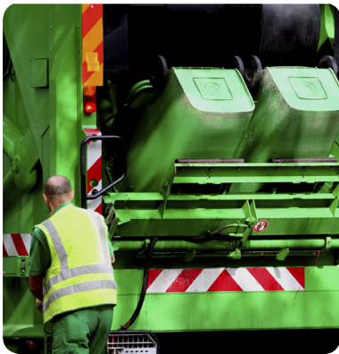
HID can create a custom tag solution to fit your application requirements for chip type, dimensions, programming and materials.